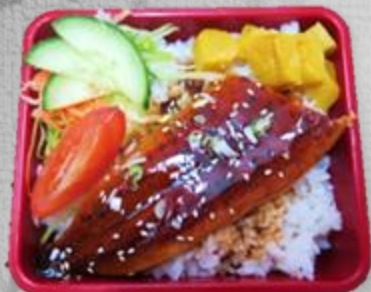
Unagi Don 照烧鳗鱼饭 £15.90

Rice bowl filled with vinegar-ed Japanese pearl rice, topped with chopped of salmon, tuna & edamame