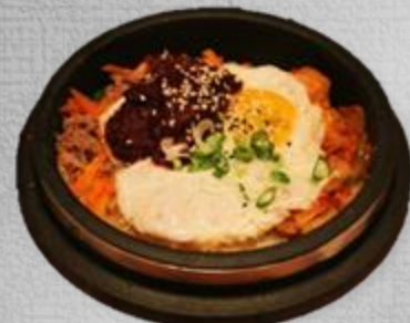
Bibimbap 石伴饭 £14.90

Rice bowl filled with vinegar-ed Japanese pearl rice, topped with assorted slices of sashimi. Full of happiness in a bowl!