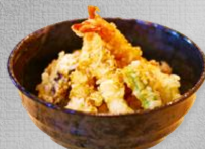
Ebi Ten Don 炸虾天妇罗饭 £12.90

Rice bowl filled with Japanese steamed pearl rice, topped with teriyaki chicken slices & salad vegetables.