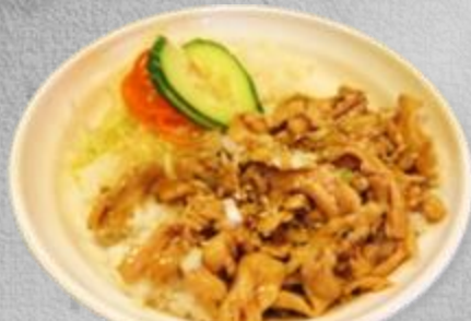
Tori Teri Don 照烧鸡肉饭 £11.50

Rice bowl filled with Japanese steamed pearl rice, topped with fried pork cutlet, served with katsu sweet sauce, and egg taste similar to teriyaki sauce.