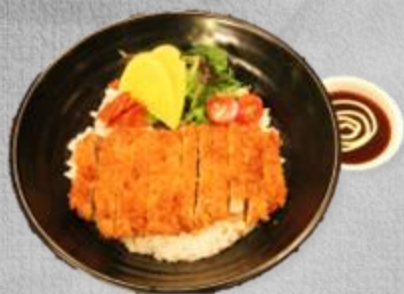
Tori / Ton Katsu Don 日式鸡/猪扒蛋饭 £11.99 (chicken) / £12.99 (pork)

Minced beef, kimchi, carrot, topped with egg and hot spicy sauce & served in hot stone bowl. Mix and stir it before enjoying this hot and tasty rice bowl.