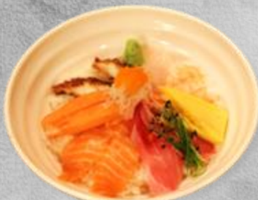
Chirashi Don 刺身饭 £15.50

Rice bowl filled with Japanese steamed pearl rice, pickles & fillets of eel grilled in a style known as kabayaki.