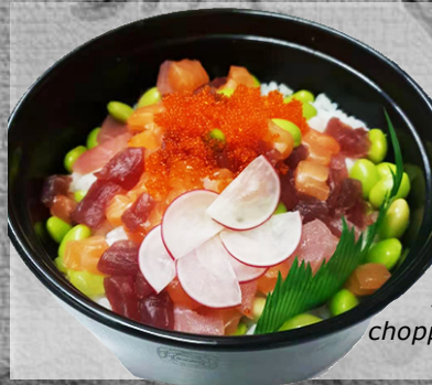
樱花刺身饭 Sakura Don £13.90

Rice bowl filled with vinegar-ed Japanese pearl rice, topped with chopped of salmon, tuna & edamame